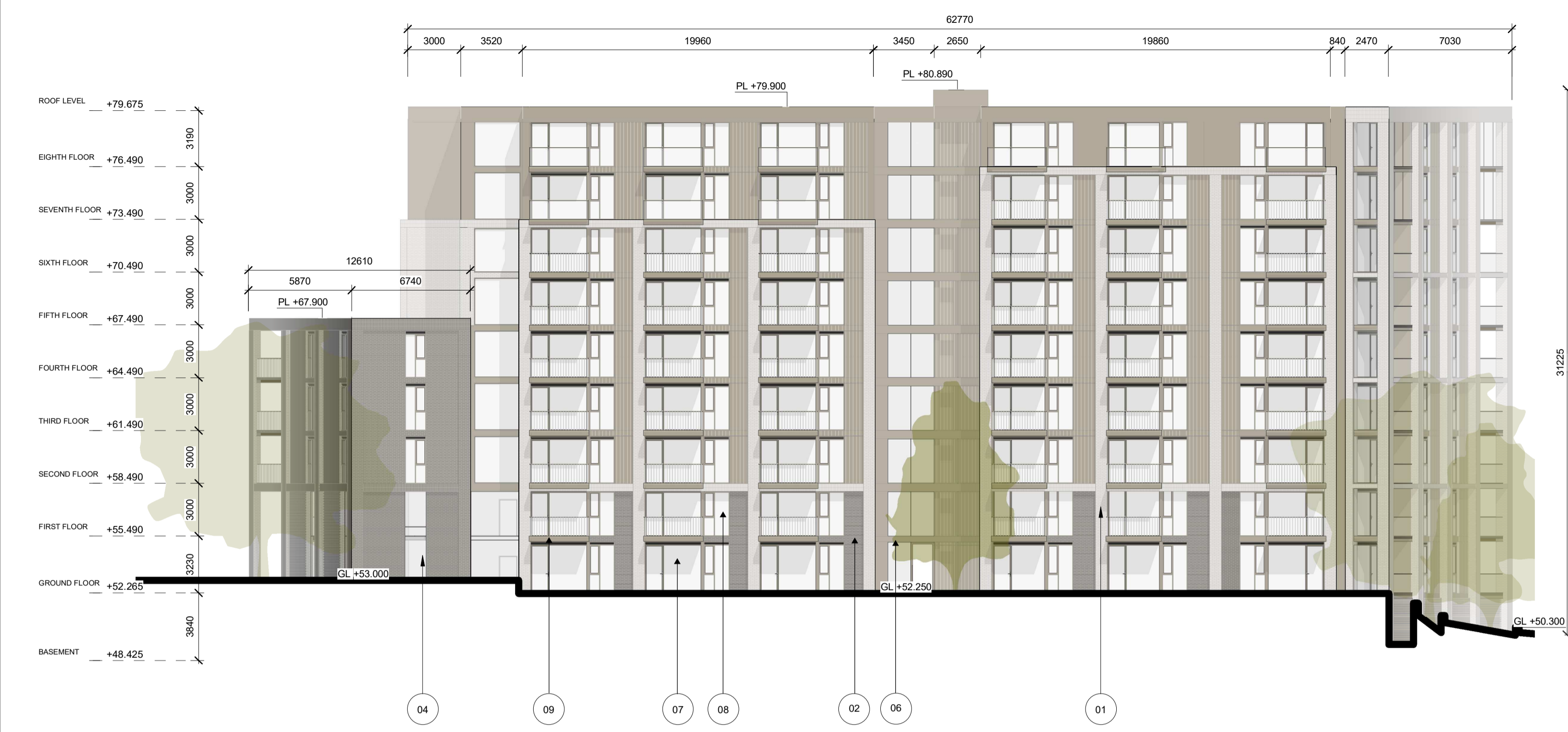
1 BUILDING B - ELEVATION - EAST 1 : 200