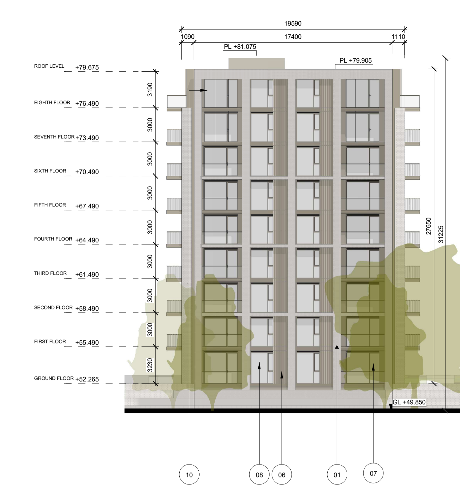
2 BUILDING B - ELEVATION - NORTH 1 : 200