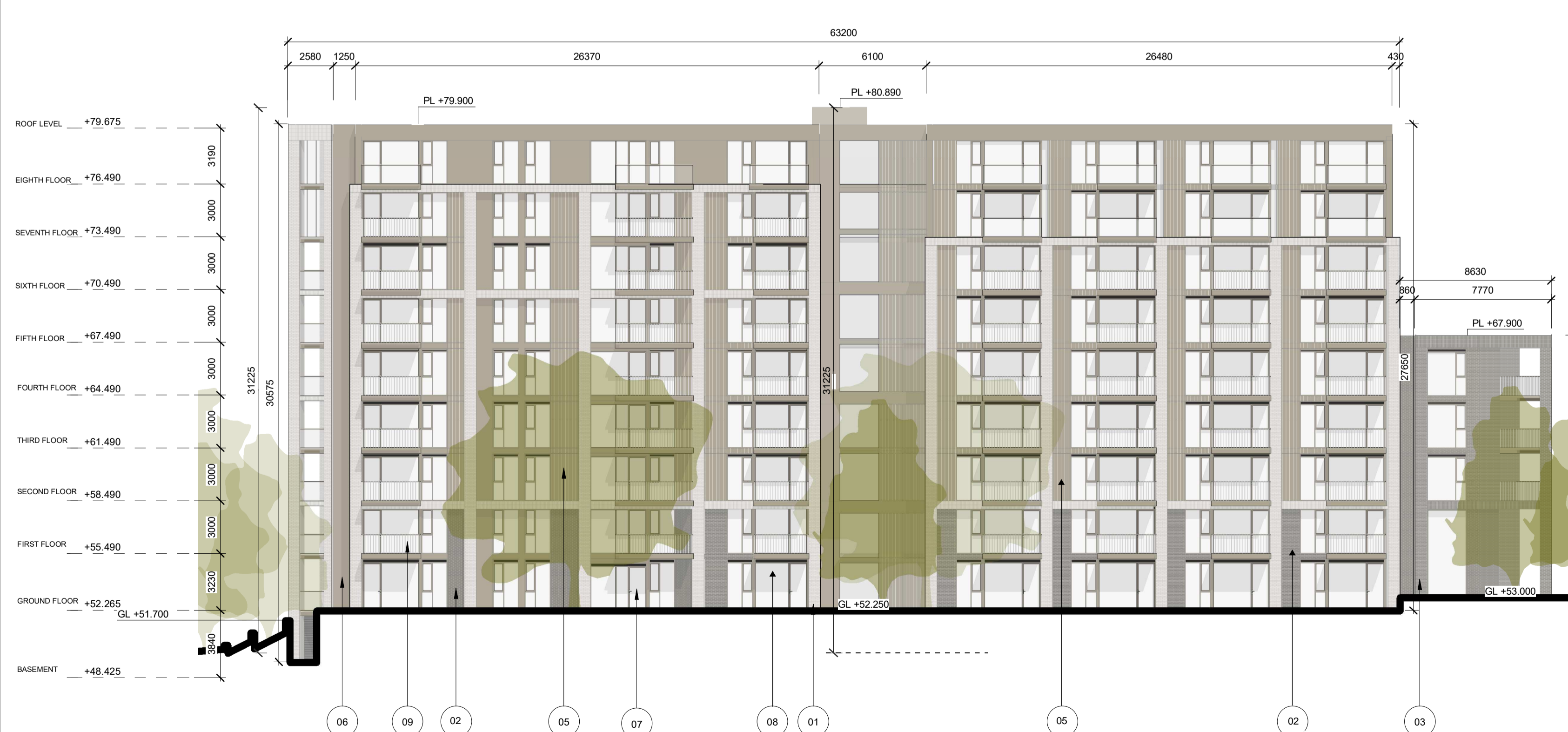
4 BUILDING B - ELEVATION - WEST 1 : 200