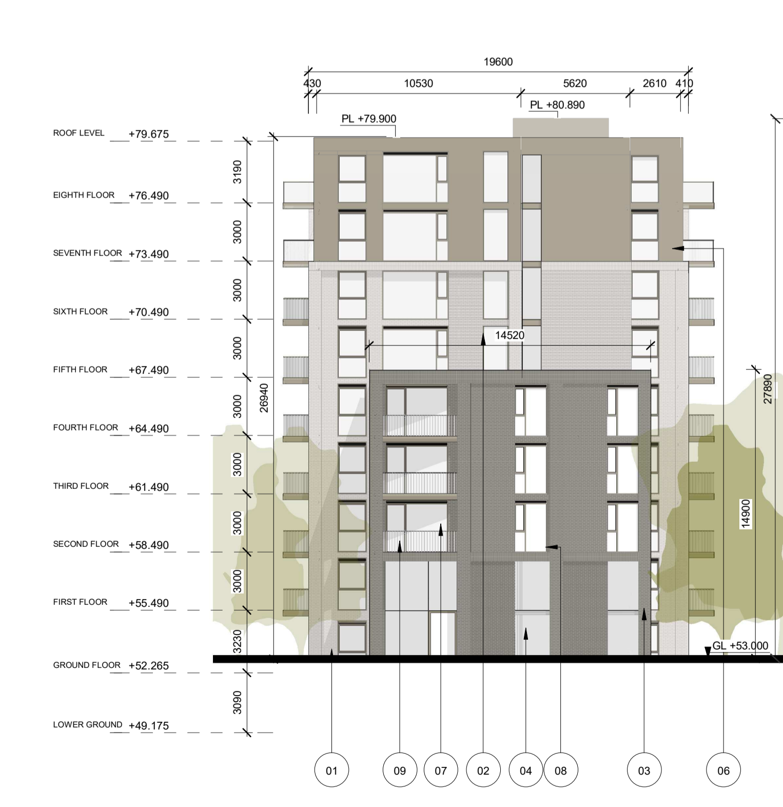
3 BUILDING B - ELEVATION - SOUTH 1 : 200